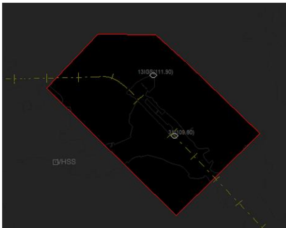
Figure 10.1: Location of VHHX ATZ in relations to other control zones. (Picture source: Hong Kong VACC Sector File)

10.1.3. The boundary of the Kai Tak ATZ is a rectangle with its edges extending two (2) nautical miles from RWY 13/31. Certain parts of the Kai Tak ATZ fall into Port Shelter (PSH) UCARA. The boundary of UCARA shall prevail, and, as such, the boundary of Kai Tak ATZ on the northeast side where it overlaps with UCARA shall follow the boundary between Island Zone and UCARA instead.